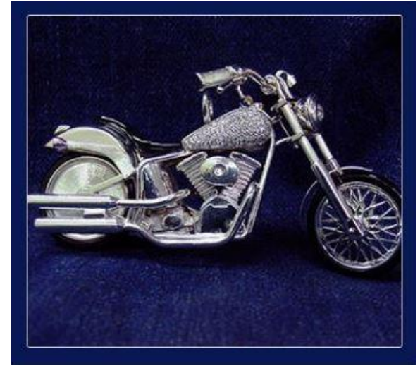
Harley Davidson - Custom 18kt white gold Harley Davidson. 1.00ct round diamond in head light, 2.50ct total weight of round diamonds.