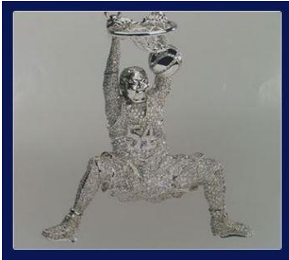
Chris Wilcox - Custom 18k white gold pendant designed for NBA star Chris Wilcox, based off a newspaper clipping from his last college game. Pavé set with round brilliant cut diamonds.