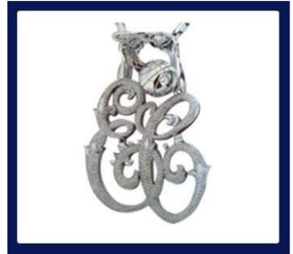
Eddie Curry - Custom 18k white gold pendant designed for NBA star Eddie Curry, with pavé set round brilliant cut diamonds.