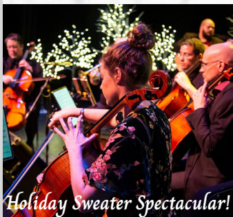
PORTLAND CELLO PROJECT Dec. 13