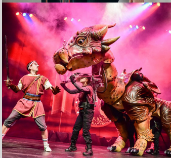
DRAGONS & MYTHICAL BEASTS March 22