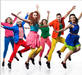
CHICAGO TAP THEATRE Oct. 22

Advertising in our 2024-2025 Season Program guarantees your ad will be seen on 5 different occasions by an audience of over 500 people. That's a circulation of almost 2500 views!