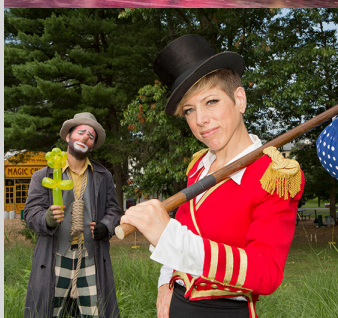
BINDLESTIFF FAMILY CIRKUS April 25