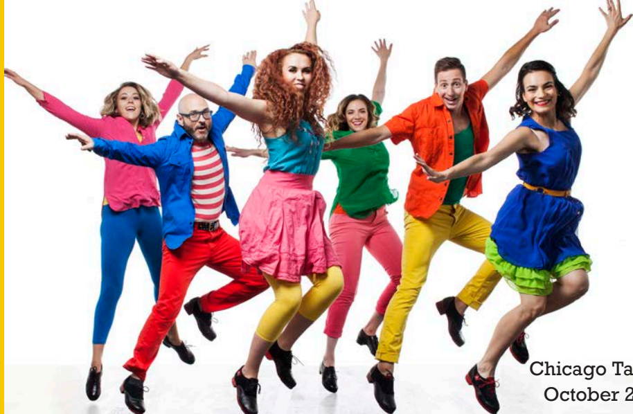
Chicago Tap October 22