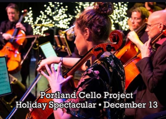
Portland Cello Project Holiday Spectacular • December 13