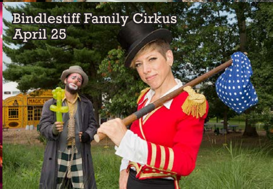
Bindlestiff Family Cirkus April 25