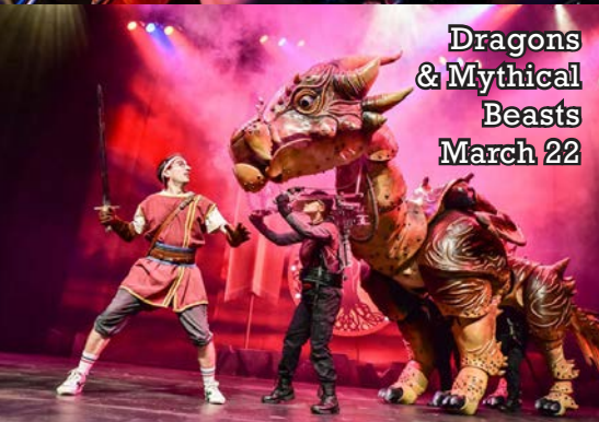
Dragons & Mythical Beasts March 22