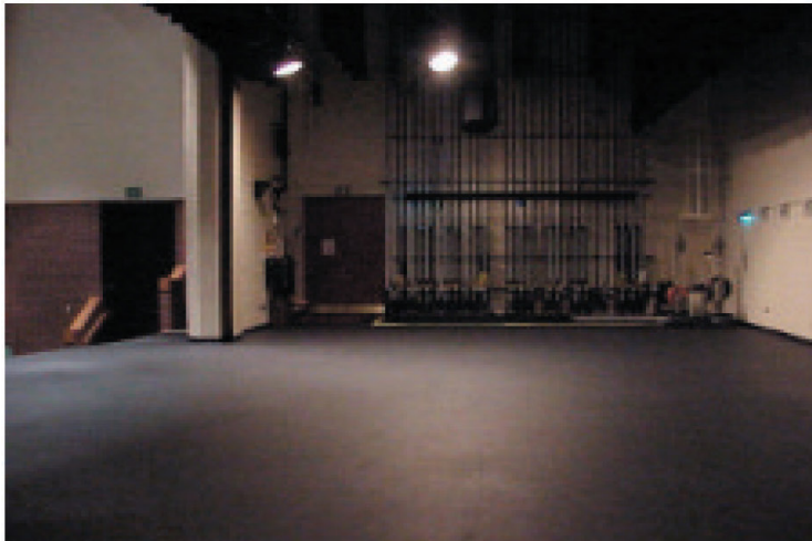
Stage Right Wing