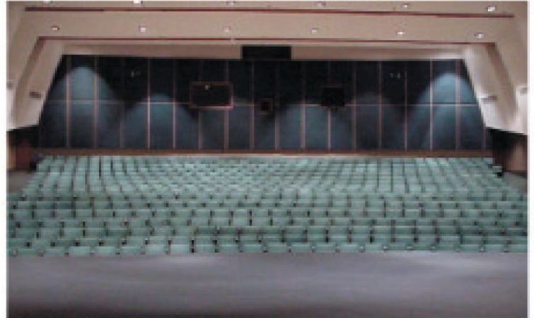
View of House from stage