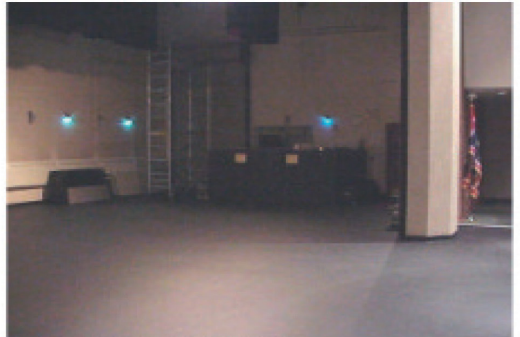
Stage Left Wing, Load-In Door