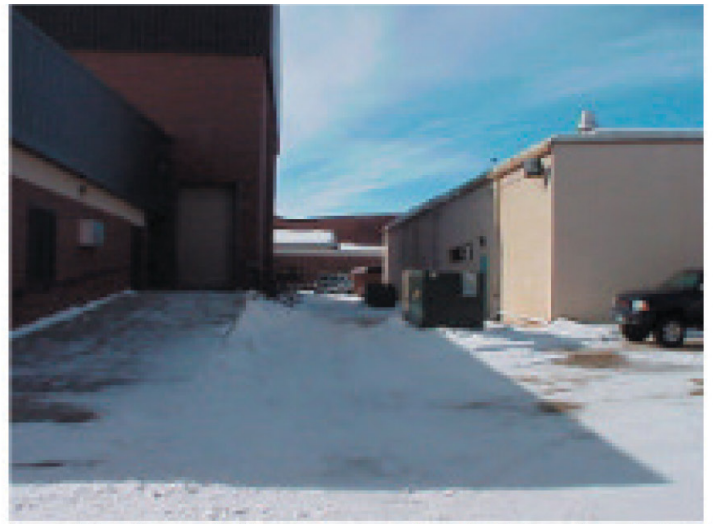
Load-in Door & Ramp area (east side of building)