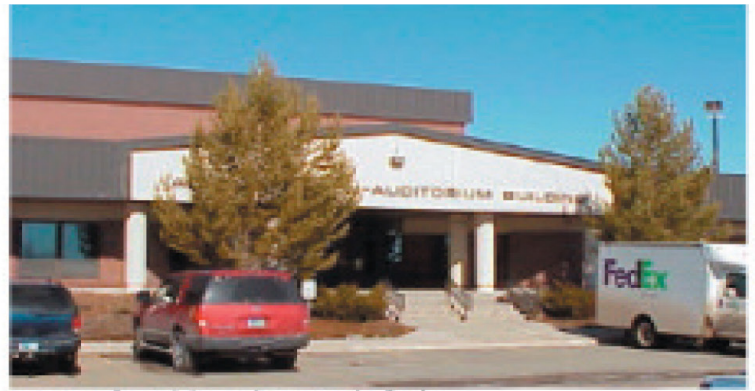
Front of Building (Hennick St.)