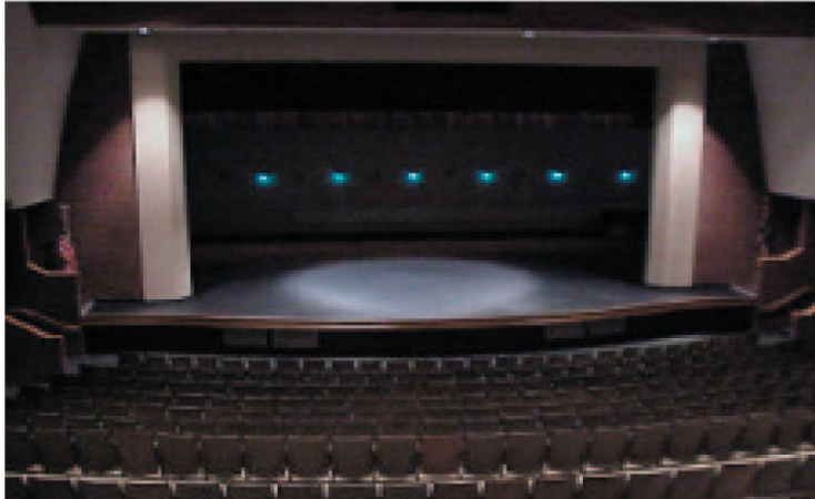
View of Stage from sound booth