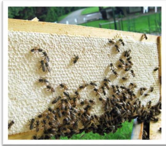
How Sweet it Is!

It appears that many beekeepers are experiencing a very good Honey year. We are hearing about lots of supers full of capped honey and getting questions about extracting honey – about when and how to extract honey.