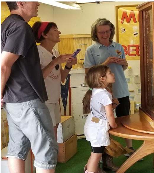
Observation Hive in Action!