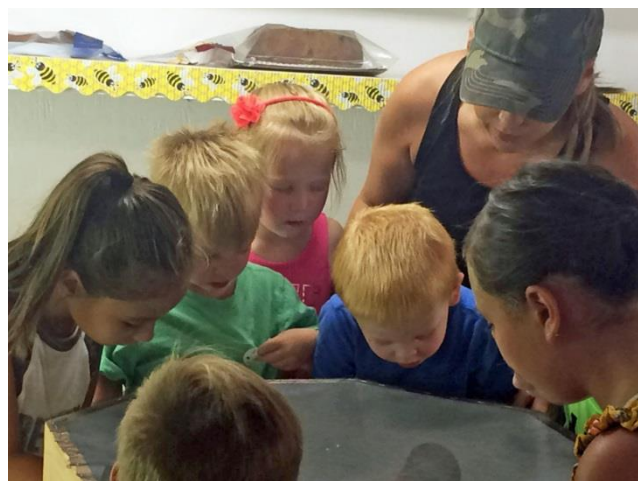
2Drone Petting - The hit of the Fair!