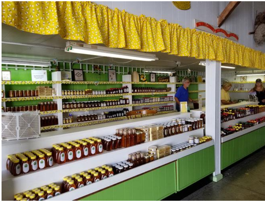
1Best Looking Booth at the Fair!

We can also use some help on Saturday, July 30 to help decorate the MCBA booth. Signs, pictures, decorations, etc. all have to be completed to make sure our booth is the class of the fair. We should finish by 11:00AM.