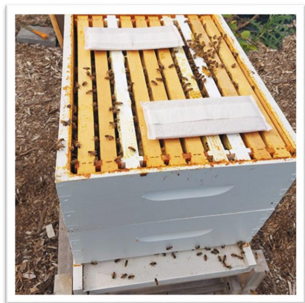
One Type of Treatment - Formic Pro on the Lower Deep