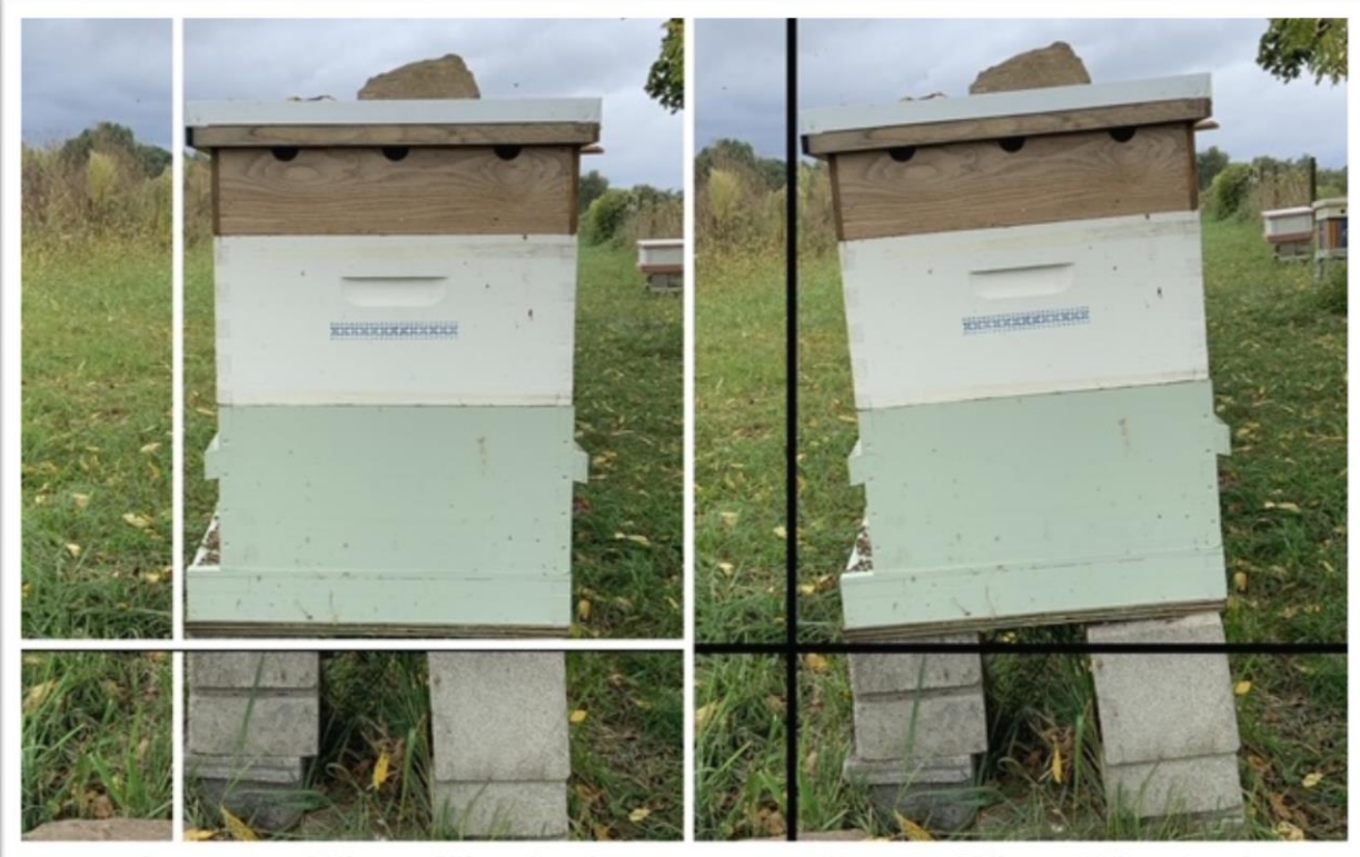
Incorrect Winter Hive Angle

Tilt your hives forward: As seen in the photo below, you should tip your hives forward so water runs off the edge of the landing board. Also, this will help the water that drips off the lid fall away from the landing board. If water drips from the lid on the landing board the splash can cause and ice dam at the entrance in the middle of winter.