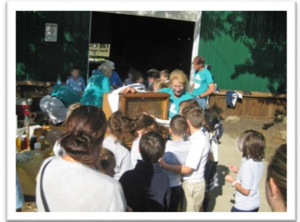
The kids (and volunteers!) had a blast!

MCBA set up two tables, including an observation hive, a drone petting box, and a lot of bee-related items. In addition, the kids got to try on a bee suit and have their pictures taken. It was a blast! The event was cancelled in 2020 and 2021 due to COVID, but is back on this year. If you would like to volunteer, details will follow soon.