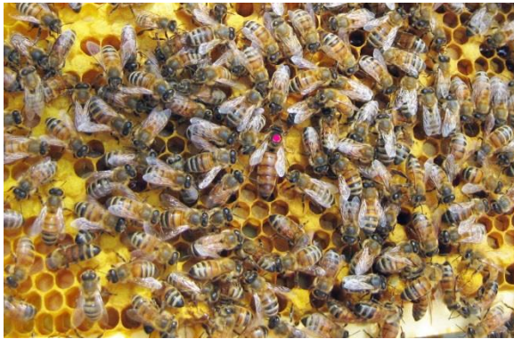
Healthy Queen, Strong Hive

These topics require me to state that my comments are my opinions, based on my experience. Others may disagree (so what's new?)