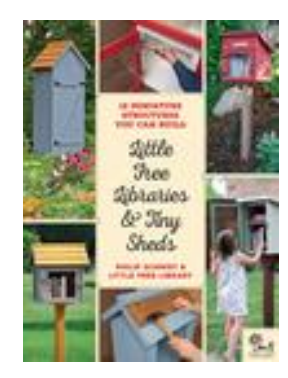
Little Free Libraries & Tiny Sheds: 12 Miniature Structures You Can Build