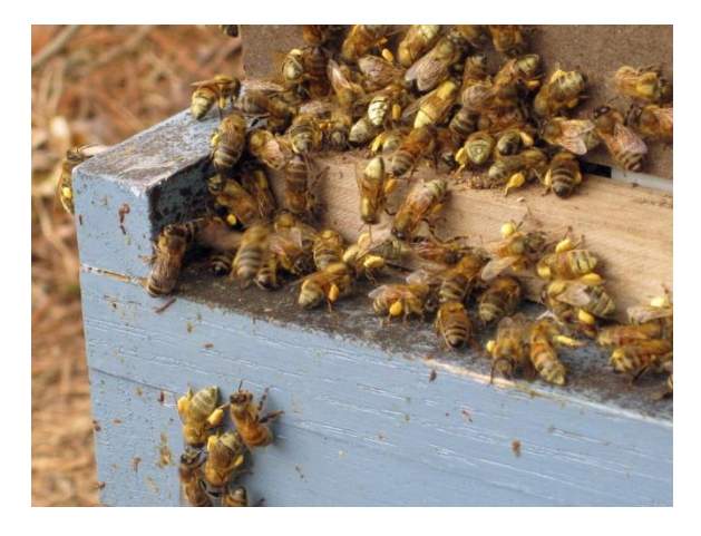
This Much Activity, Remove Mouse Guard!

time . Why? The bees are very active. So, a mouse trying to enter now would probably regret it. I watch my hives. As soon as I see them backing up at the entrance on a nice day, I remove it. Or if you see pollen being lost at the entrance as they go through the holes.