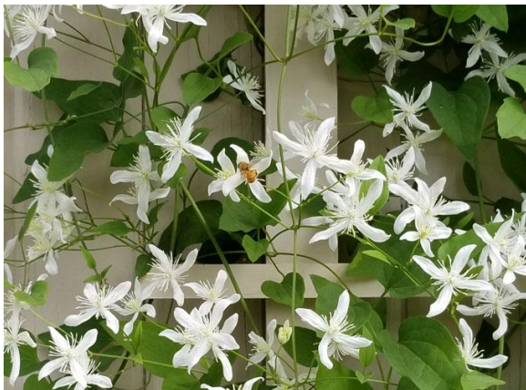
Honey Bee on Sweet Autumn Clematis

Some of you may be familiar with Sweet Autumn Clematis. Grows 15-25 feet high first year, covered with beautiful white flowers in late Autumn and September. See the big one at QRC.