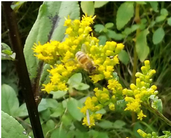
Honey Bee on Goldenrod

Fall plants that the bees like are finally opening (writing this Sept 9). First saw some bees on the Goldenrod two days ago. A lot of wasps, hornets, bumblebees, and yellow jackets – and a few bees. On a bright note, I'm seeing increased activity for both nectar and pollen for the first time in several weeks.