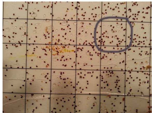
Mite drop max was about 15-30 in 24 hrs. One of mine had more than that in the one little square! (Couple hundred squares per sticky board). Total 1,735 in 24 hrs.! I had to scramble to save the hive.

A final reminder to watch the mites! I check my inserts regularly this time of year. If I see any on the insert I do a shake or wash to double check. Same number of mites, a lot less brood, so the visible number can jump! It is very rewarding to see our newer beekeepers checking regularly. Years ago, I was the Varroa Mite King of Medina! (A dubious honor!) I kept thinking I was doing better, and then late fall... Yikes!!!