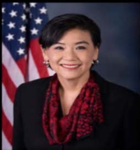
KEYNOTE SPEAKER Congressmember Judy Chu 27 th Congressional District