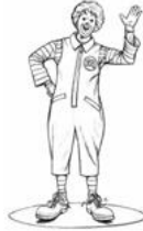
McDonalds Kids Day Tuesday, August 9, 2022