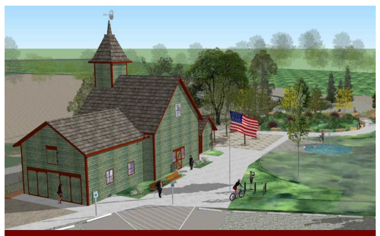
WATER TOWER BARN - SCANDIA ARTS & HERITAGE CENTER