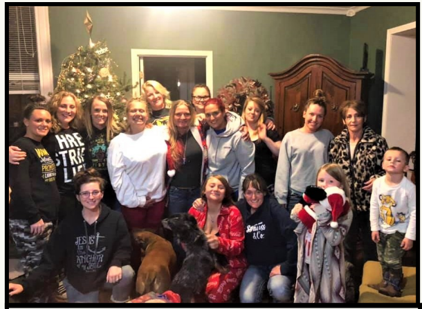
Christmas at The Healing House on December 16