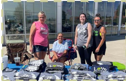
The Healing House residents volunteered with CMFCA washing cars at Honda on June 4th.