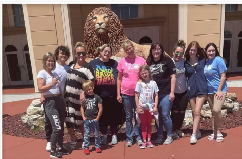
This summer has filled all of our cups to overflowing as the residents and staff enjoyed life to the fullest!