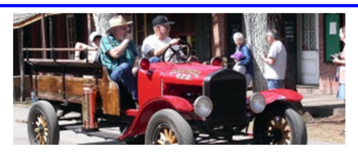
60th Annual Firemen's Muster Columbia State Park May 4, 2019