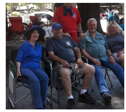
August 2019, Volume 41, Issue 8