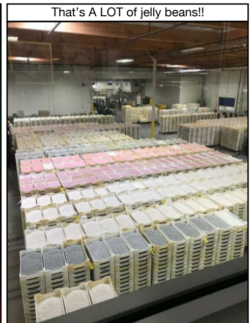
That's A LOT of jelly beans!!