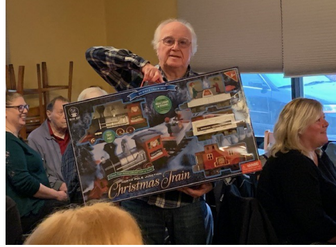
several times. Not sure if he ended up with it or not

We'd like to wish all of our DVMA members and their families a very merry Christmas season and a healthy, safe and blessed new year!