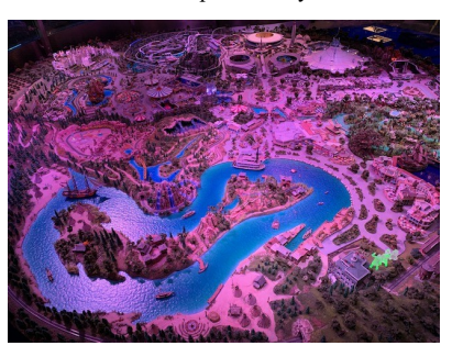
December 2019, Volume 41 Issue 12