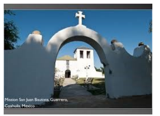
Mission San Juan Bautista. Great little town with terrific restaurants! Spring drive, maybe?