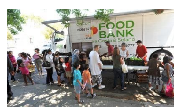
The Food Bank can always use our help. We had such a fun and rewarding time last time.