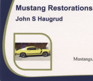
1894 Renee Way Concord, CA 94521

Dealer for: Scott Drake Covercraft Croftgate USA Coker Tire Champion Cooling