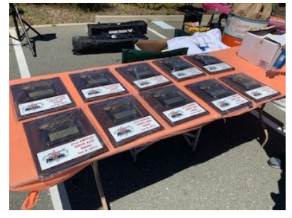
A new look for our trophies this year