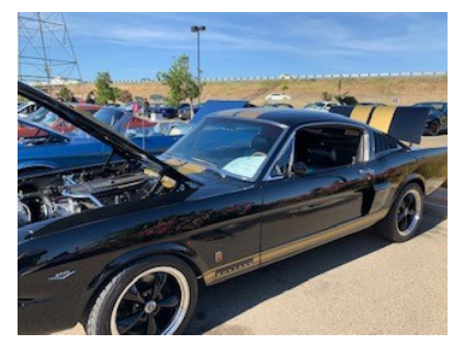
This car has been to a number of our shows