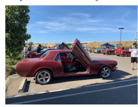
Now that's what I call "easy access"