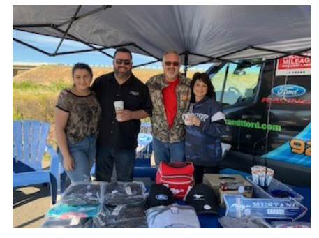
Bill Brandt Ford team at their booth. They also brought some beautiful 2019 Mustangs to drool over!