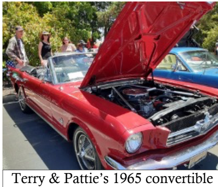
Terry & Pattie's 1965 convertible