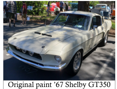
Original paint '67 Shelby GT350