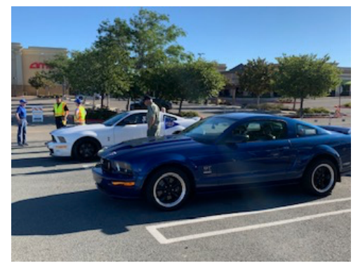
Continued on next page...