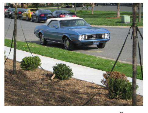
Parked in front of the Mustang Owners" Museum One