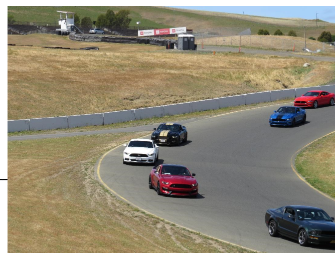
Cars were able to get a little more speed on the downhill.