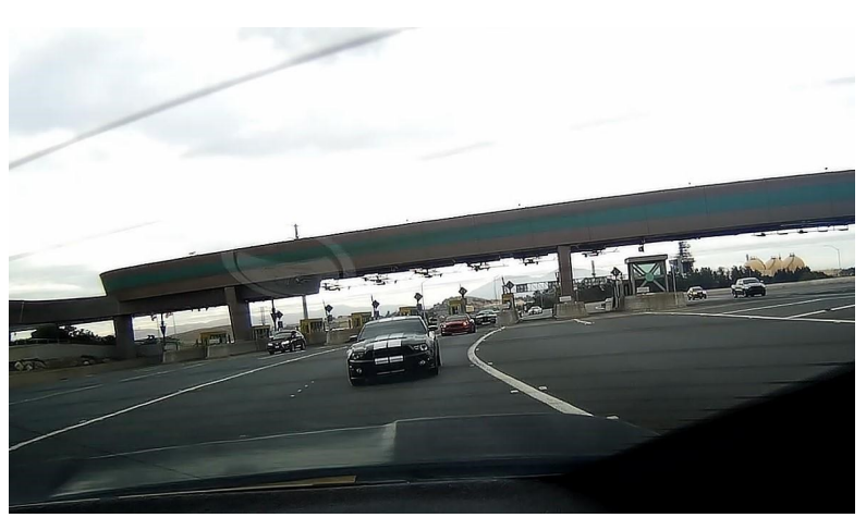
Awwww, over too soon!