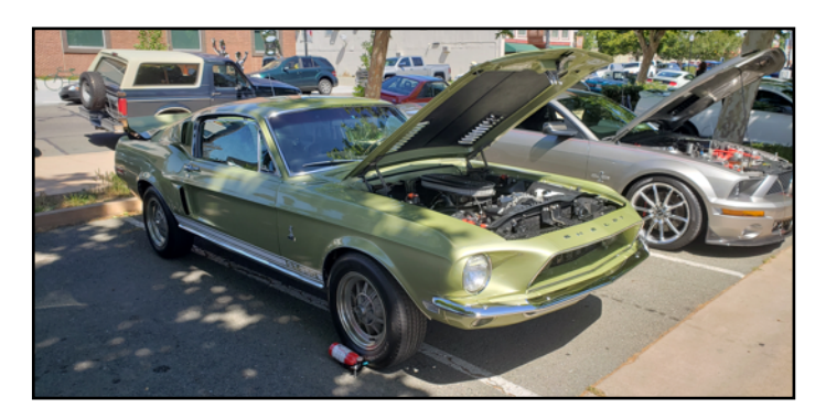
June 2022, Volume 44, Issue 6