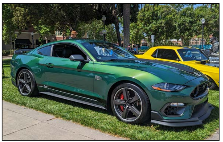
Continued on page 5...