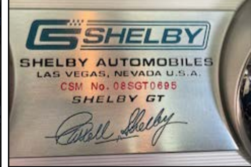
June 2024, Volume 46, Issue 6