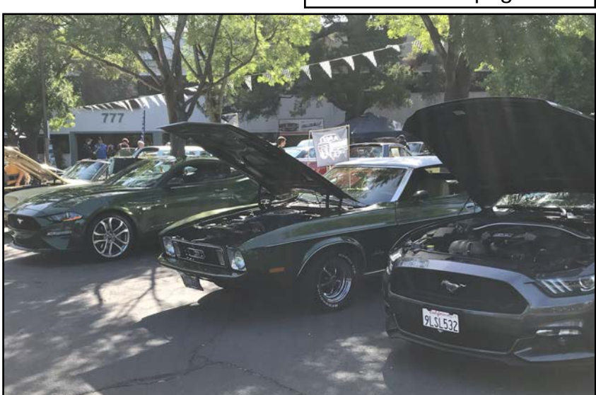
June 2024, Volume 46, Issue 6