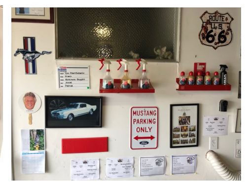
Very neat and organized, Tom, just like your beautiful car. Happy National Mustang Day!