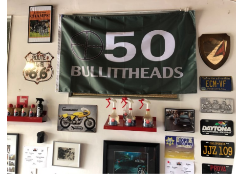
Tom's Wonder Wall with some interesting mementos.