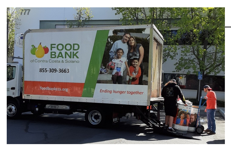
Food Bank received the equivalent of 6,034 meals!