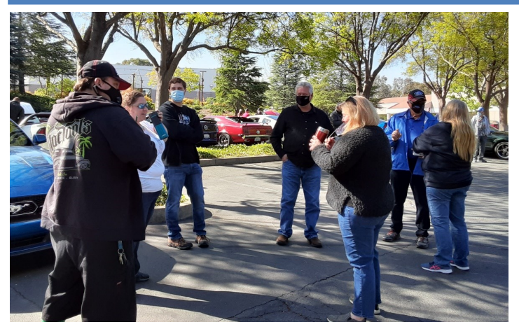
A little distance socializing after dropping off our donations