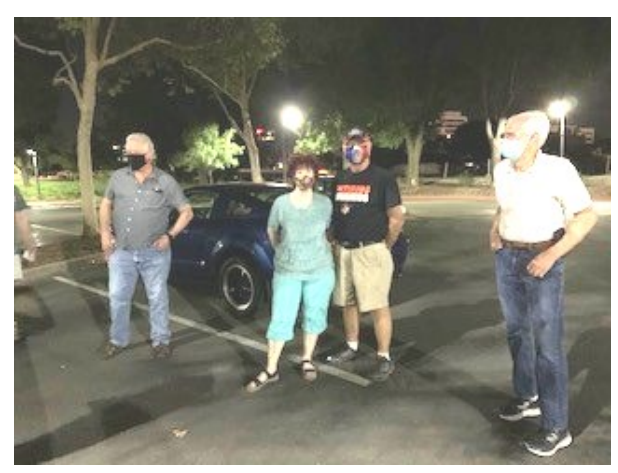
November 2020, Volume 42, Issue 11