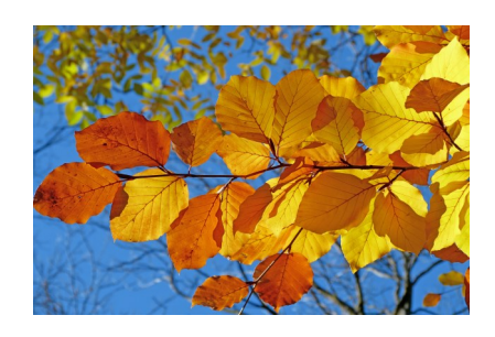
November 2020, Volume 42, Issue 11