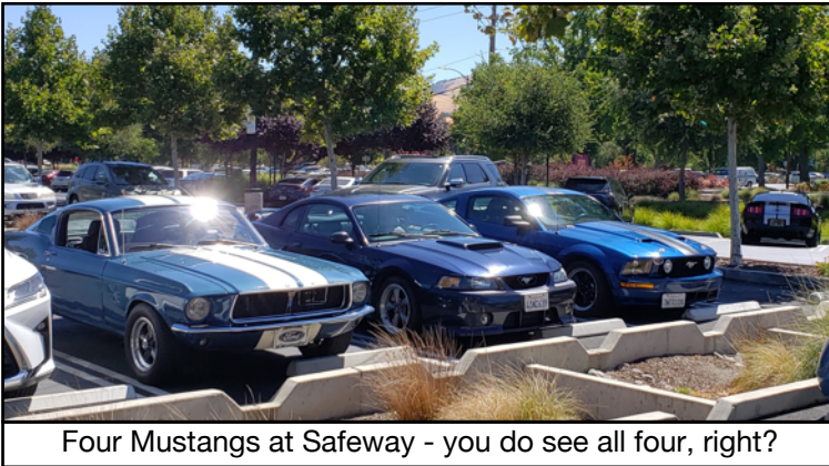
Four Mustangs at Safeway - you do see all four, right?