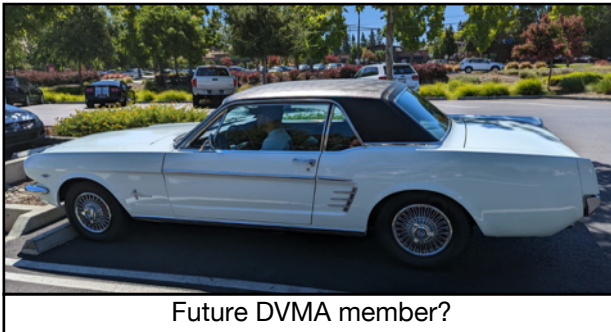
Future DVMA member?