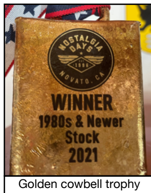
Golden cowbell trophy