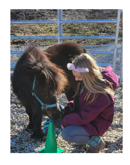
"I am a leader. I've never thought of myself as a leader before."