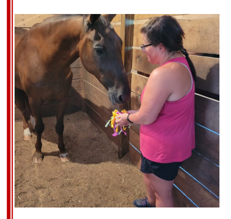
"The thoughts I have about myself aren't always true. I can replace a belief about myself that isn't true with something positive that is true."