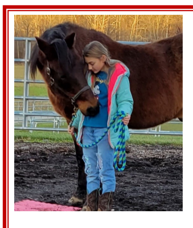
"I've been faking things my whole life. I need to be honest with myself and others."