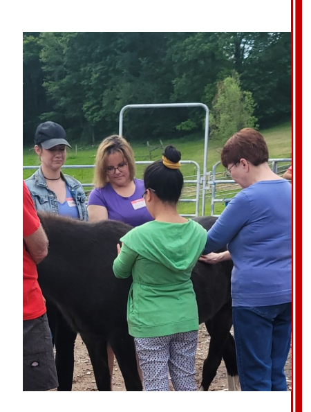
"Simple activities can lead to really insightful revelations about internal realities."