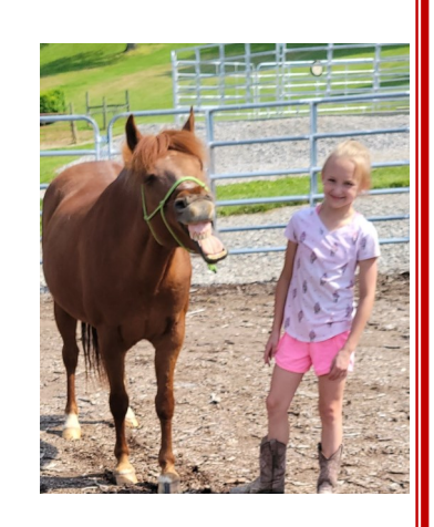
"It is good to set boundaries for myself and to hold those boundaries."