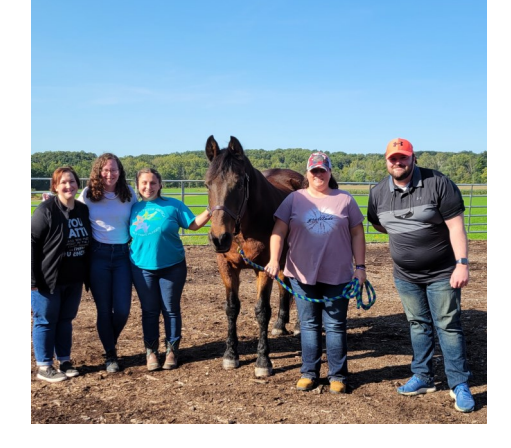
"It was a perfect way to grow together as a team."