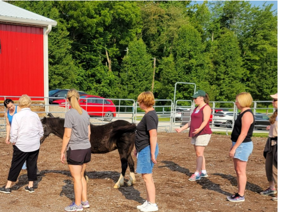
"Such an amazing experience and I learned so much about our team and myself."