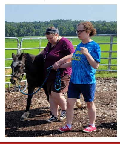
"Horses don't hold grudges. I am learning to let go of past hurts. There is freedom in that."