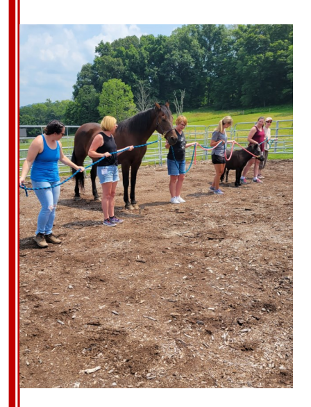
"The care given to tailoring the experience to us was incredible and made it much more meaningful."

"Our team will be forever changed thanks to you and the horses."