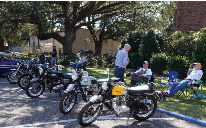
British motorcycles are welcome at the show; this year, five were on display, ranging from 1960 to 2012 models.