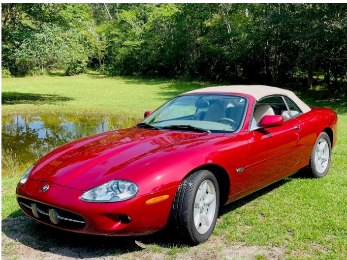
Bruce's current Jaguar, a 1998 XK8 convertible

Every Jaguar has a story and my car is no exception. I started looking for a well-cared-for XK8 coupe about two years ago. Honestly, I believe these XK8s are one of the best bargains on the used sports car market. You can buy a clean low mileage one for less than $10K and know that your purchase is only going to go up in value in future years [ Lots of folks agree, Bruce—we had seven of this series at the BCF-Ed. ].