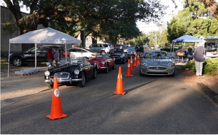
Registrants line up for check-in.

Due to space and time constraints, Ed. had to limit the number of 2022 British Car Festival photos in the October issue. Herewith are a few more, and as always, Ed. regrets if you or your car are not included.