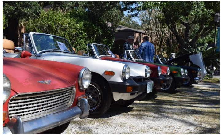
Sprites and Midgets