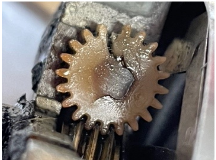
Stuck Clutch 1 , Wheel Spline 0 .

With shiny new wheels and hubs now on the car, Dennis and I decided not to try breaking the clutch loose by