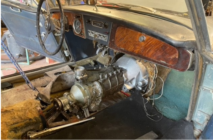
Unlike MGBs, this transmission can be removed from the cockpit.