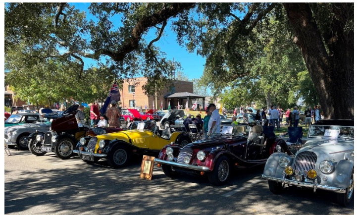
Moggies all in a row.