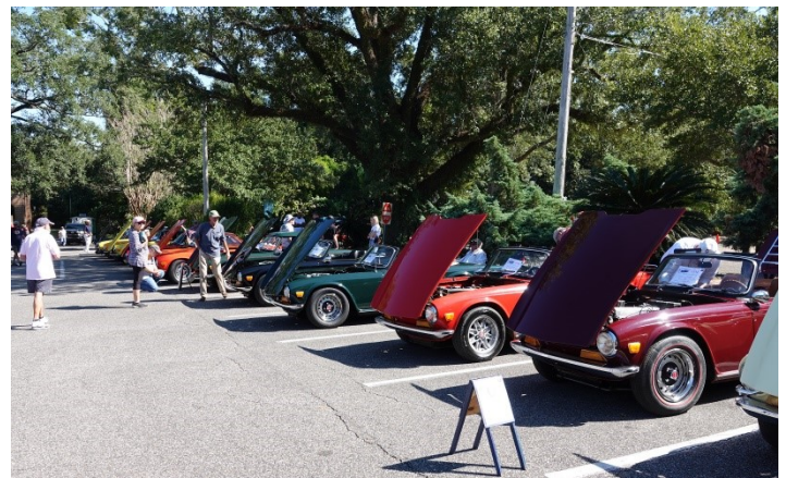
Triumph TR6s were featured; 20 were registered in two classes. Top honors went to Danny Varnado and Dwyke Rushing .