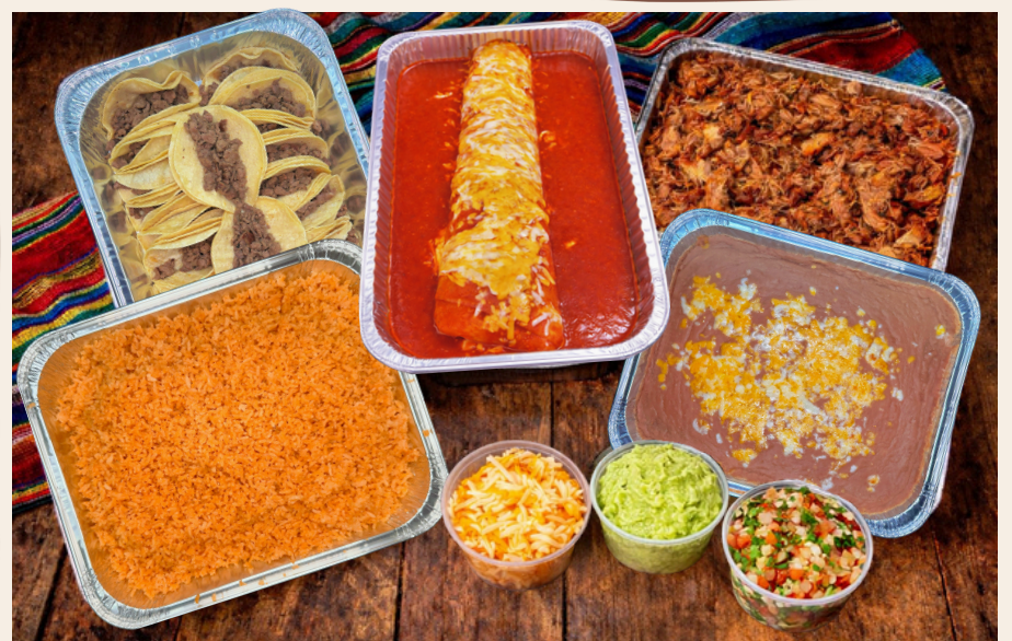
Serving sizes and containers may vary based on order size.

Add-on prices apply only to the menu section in which they are listed. No coupons or discounts can be combined with this offer. Pricing may vary depending on location. No substitutions or modifications • Must be packaged together. Extra sauces or cheese may be subject to charge. Prices do not include tax