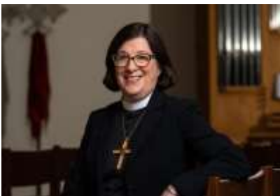
Presiding Bishop of the ELCA, Elizabeth Eaton (originally appeared in Living Lutheran, November, 2020)

Here is another simple recipe: flour, water, wine, the body and blood of Jesus. A meal of healing, forgiveness and thanksgiving. No matter what, when our Lord tenderly and urgently invites, "Supper's ready," we all come to the table. There in our common brokenness we meet each other in Christ.