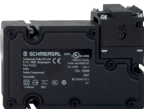
ID: ktzf-f14 | 350.6 kB | .jpg | 352.778 x 254 mm - 1000 x 720 px - 72 dpi | 34.7 kB | .png | 74.083 x 53.269 mm - 210 x 151 px - 72 dpi