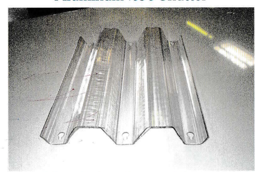
Clear Polycarbonate Shutter

High Level Protection at a Low Cost -New Storm Panels are a common choice for those on a budget.