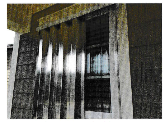
Aluminum .050 Shutter

South Carolina will pay up to 31% of the cost with a Tax Credit. Call for details.