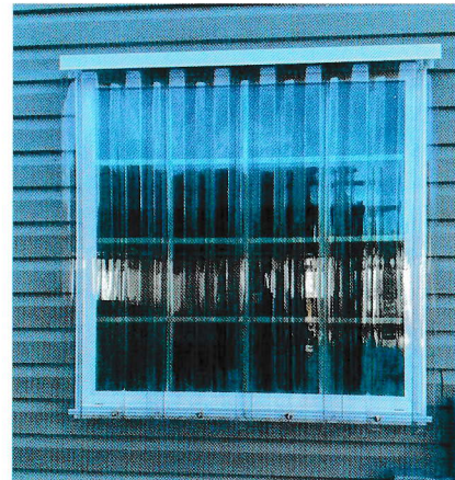
Clear Polycarbonate Shutter