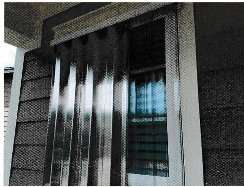
Aluminum .050 Shutter