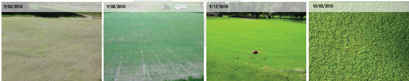
Time lapse photography shows how quickly Yellow Jacket coated bentgrass establishes all while reducing water usage. Pine Lakes Golf and Tennis Club in Lincoln, Nebraska. Pat Jones, Superintendent was mowing at 1/2" 3 weeks after sowing.