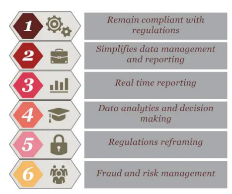
Figure 4: Uses of Regtech Technology

Regtech helps Financial Institution to better comply with regulations more effectively and efficiently. They are constantly working with new and evolving regulations and understanding what-if situations, helping their users in the following areas: