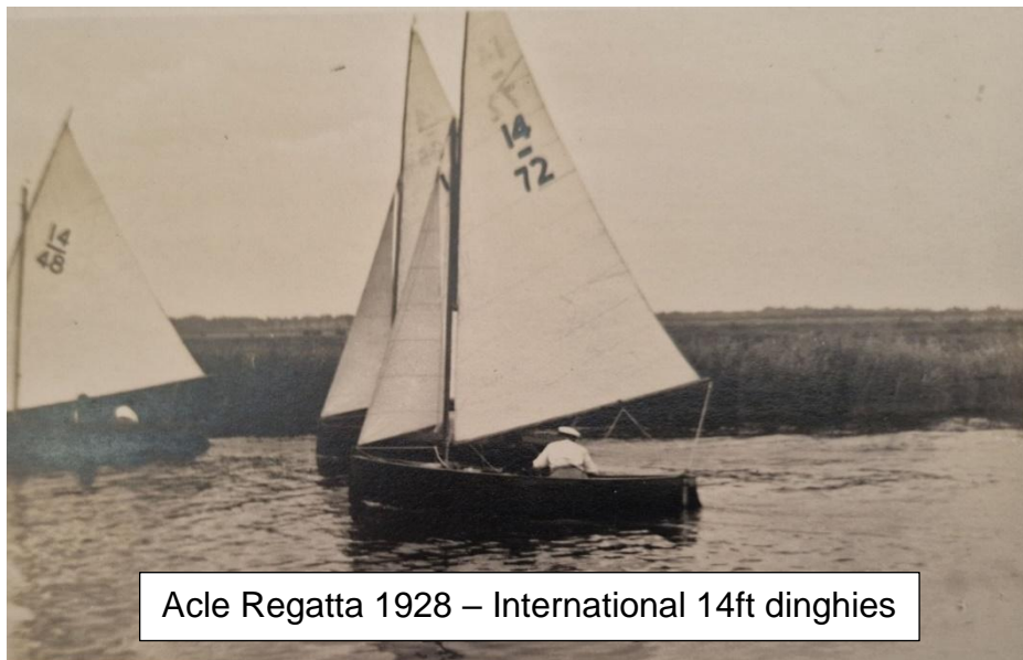
Acle Regatta 1928 – International 14ft dinghies

Visit our website www.gyyc.co.uk or facebook www.facebook.com/groups/GreatYarmouthYC