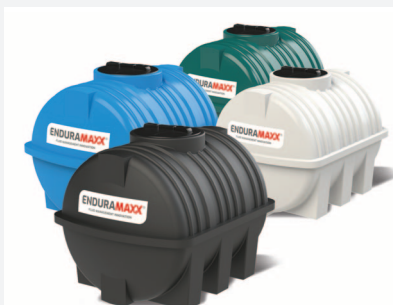
1,000 Litre 171210 1420 L x 1100 W x 1020 H 220 gallons 0.8 cubic metres