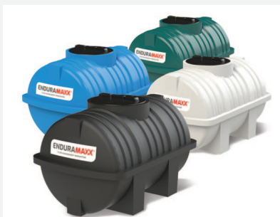
500 Litre 171205 1295 L x 840 W x 850 H 110 gallons 0.4 cubic metres

These plastic tanks are ideal for both rainwater harvesting and potable water storage. Our horizontal tanks are manufactured with high density polyethylene in a single rotational mould to create corrosion resistant, joint free, hygienic surfaces internally and externally.