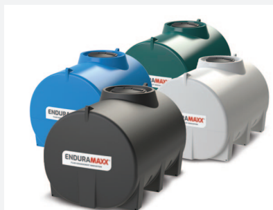
5,000 Litre 171250 2500 L x 1700 W x 1690 H 1,100 gallons 4.2 cubic metres

Because we design, engineer and manufacture in the UK, our products can also be custom made to client specifications.