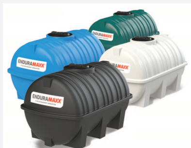
1,500 Litre 171215 1875 L x 1180 W x 1200 H 330 gallons 1.2 cubic metres