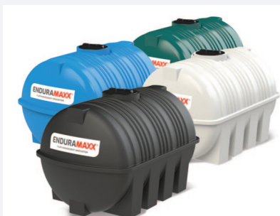
3,000 Litre 171230 2240 L x 1460 W x 1470 H 660 gallons 2.5 cubic metres