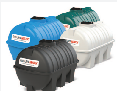
2,000 Litre 171220 1956 L x 1299 W x 1300 H 440 gallons 1.6 cubic metres