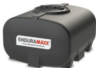
700 Litre 171015 1190 L x 1050 W x 725 H 153 gallons 0.7 cubic metres