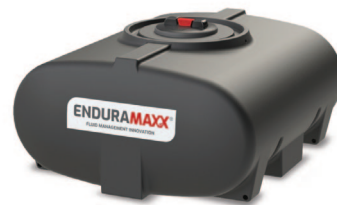
500 Litre 171005 1190 L x 1050 W x 530 H 109 gallons 0.5 cubic metres