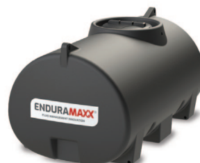
1,500 Litre 171015 1920 L x 1170 W x 985 H 329 gallons 1.5 cubic metres