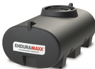
1,200 Litre 171012 1920 L x 1170 W x 840 H 263 gallons 1.2 cubic metres