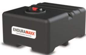
240 Litre Squat 174024 925 L x 710 W x 510 H 53 gallons 0.24 cubic metres