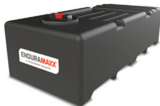
500 Litre Squat 174040 1600 L x 710 W x 510 H 132 gallons 0.5 cubic metres