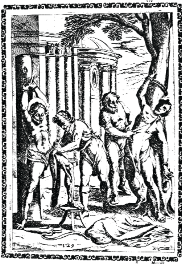
A. Martyrs being flayed alive.