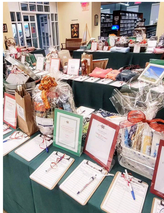
Hundreds of items available to bid on at The Millbrook Library Silent Auction