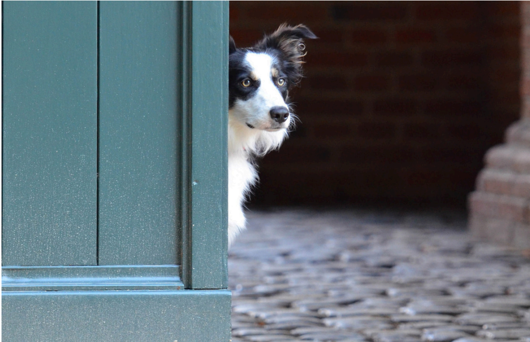
Be wary of those open gates.

If you are looking to board your dog any time, do so with a place that takes all of this into account.