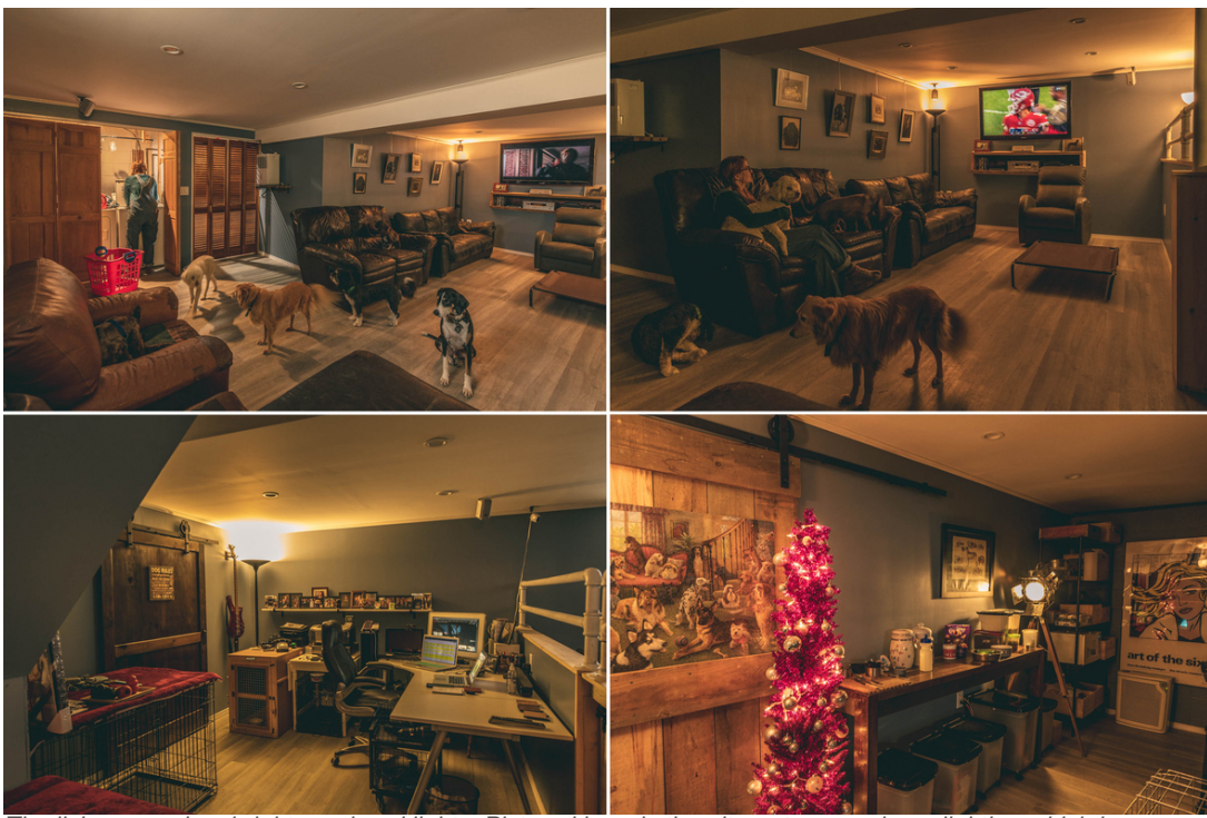
The living room has bright overhead lights. Pictured here is the alternate warm-lamp lighting which is more soothing.

The photos below show the living room that was recently completed. The living room has plenty of space for us and the dogs and it is cozy at all times. Keeping it clean is easy and feeding them is a breeze with the new feeding station. My work area allows me to be there during their naps and indoor time during inclement weather. Music is played 24/7 and we can sit and watch TV comfortably with the dogs which is a luxury in itself since we don't often have a chance to do that. My next decision is how far to take it with Christmas decorations.