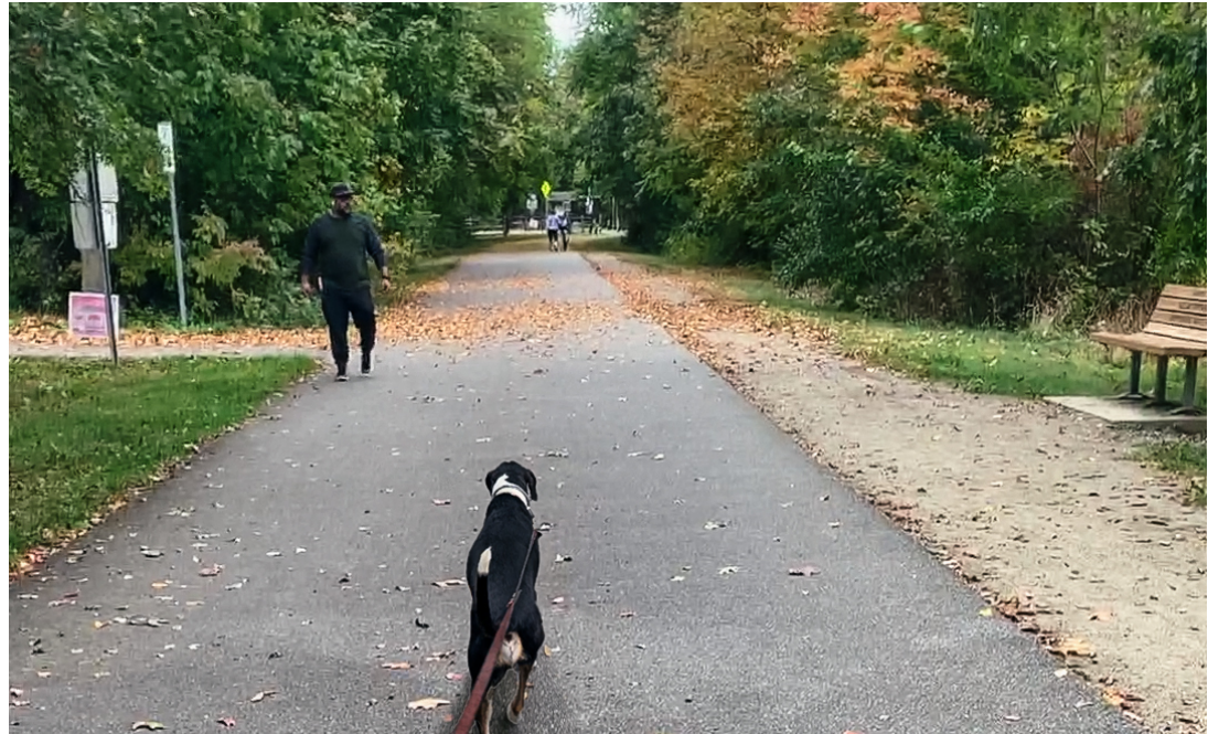
When meeting with a dog, a person may exhibit anxiety which the dog might sense, but It is important that you remain calm.