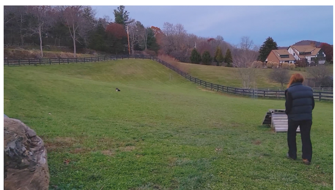
Until the dog proves reliable under many different circumstances, regardless of environment, level of distraction, and distance from the handler, he should not be off-leash and expected to come when called.

The photo above shows our client and his dog. These two are inseparable. The photo is part of a larger project that I am working on to show the connection between a dog and its owner. The plan is to one day exhibit the growing collection in a gallery.