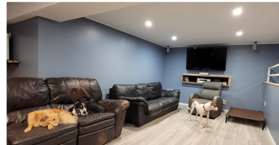
Top to bottom shows the progress of Jack's Living Room – a job well done.