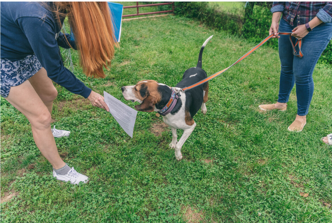
Annie makes certain that all her papers are in order.