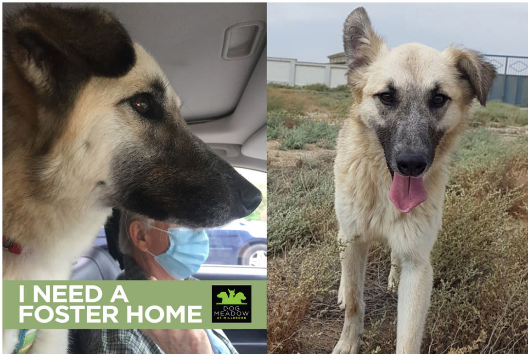
Dolce en route to Sean Casey Animal Rescue.

Annie enjoys relaxing with her new family, which include two hounds and cats. Hiking and sharing the back seat as well as pup-cup ice cream is a regular thing.