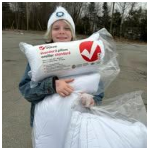
Donations to Beacon House Hats, Mitts, Scarves led by the UCW Pillows led by KOGA