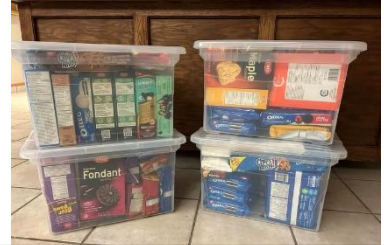
Donations of Cookies for the Beacon House Christmas Food Hampers