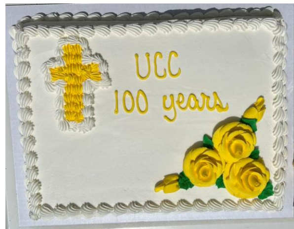
Reception of new members, baptisms and 100 th anniversary cake