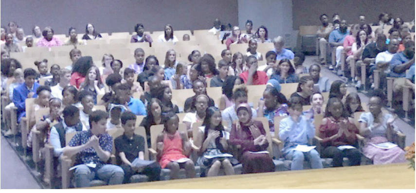
Pictured: The Northern Granville Middle School Student of Merit Award Ceremony held September 2019